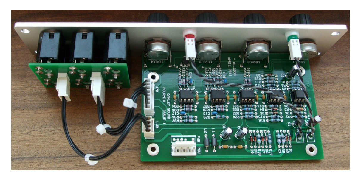
This is the prototype issue 1 Fourmix module behind a natural finish 1U wide Schaeffer panel. Note the use of the optional Sock6 socket board to facilitate the wiring up of the six sockets.

The issue 1 main PCB is 78mm (width) x 124mm (height), and the issue 2 main PCB is 75mm (width) x 124mm (height). The board is a two layer design which means it has copper tracks on both the upper and lower surfaces.