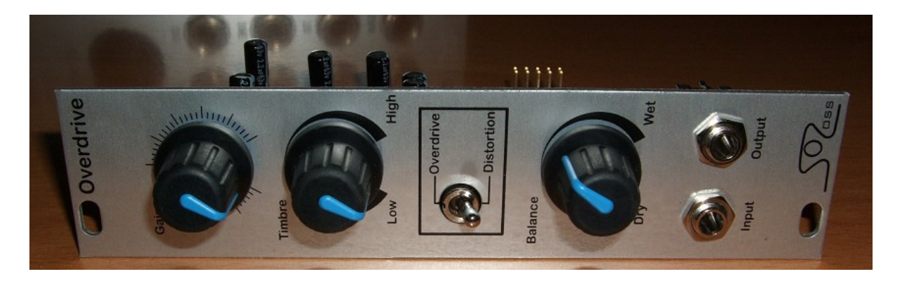
The Oakley Overdrive module for the Eurorack format. This module has been built by Krisp1.

Voltage control is determined not within this unit, but as part of the signal chain placed before this module. Using a VCA to control the signal level that is fed into this unit will determine the strength of the overdrive or distortion. Using a VCF to alter the timbre of the signal fed to this module will control the overall harmonic level far more than using a filter alone. In fact, hard sync type sounds can be easily obtained by simply sweeping the filter's cut-off frequency.